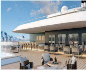
Café/Bar with swimming pool