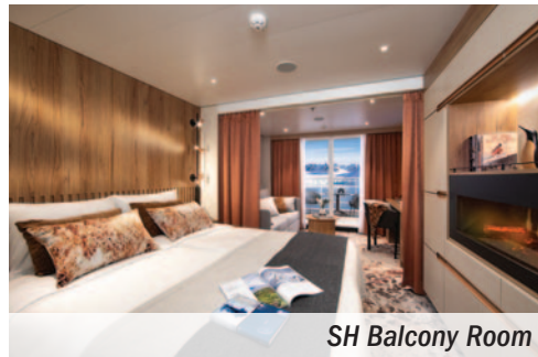
SH Balcony Room