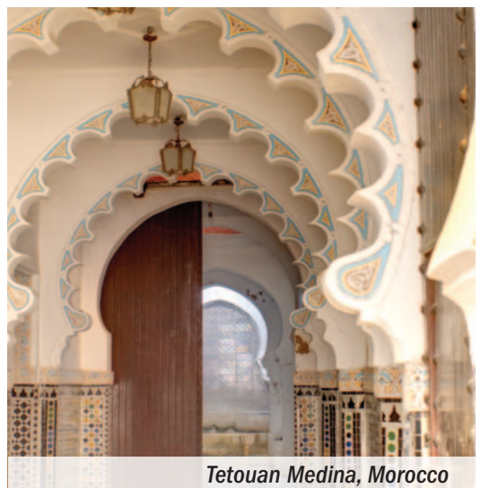
Tetouan Medina, Morocco