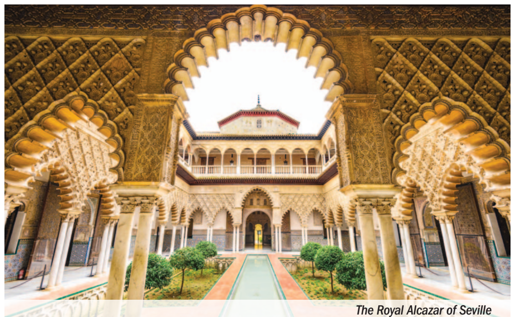
The Royal Alcazar of Seville

Note: The August 15-27, 2023 program begins in Lisbon on August 16 and ends in Palermo on August 27.