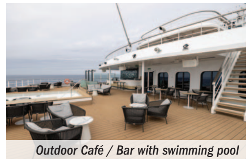
Outdoor Café / Bar with swimming pool

Currently under construction in Finland and launching in early March 2023, Swan Hellenic's Diana is a new-generation expedition cruise ship. Although at 12,100 tons the ship is large enough to accommodate more than 350 passengers, Diana will accommodate a maximum of 192 guests in 96 spacious staterooms and balcony suites. The low guest density results in one of the most generous indoor and outdoor space-to-guest ratios among cruise ships.