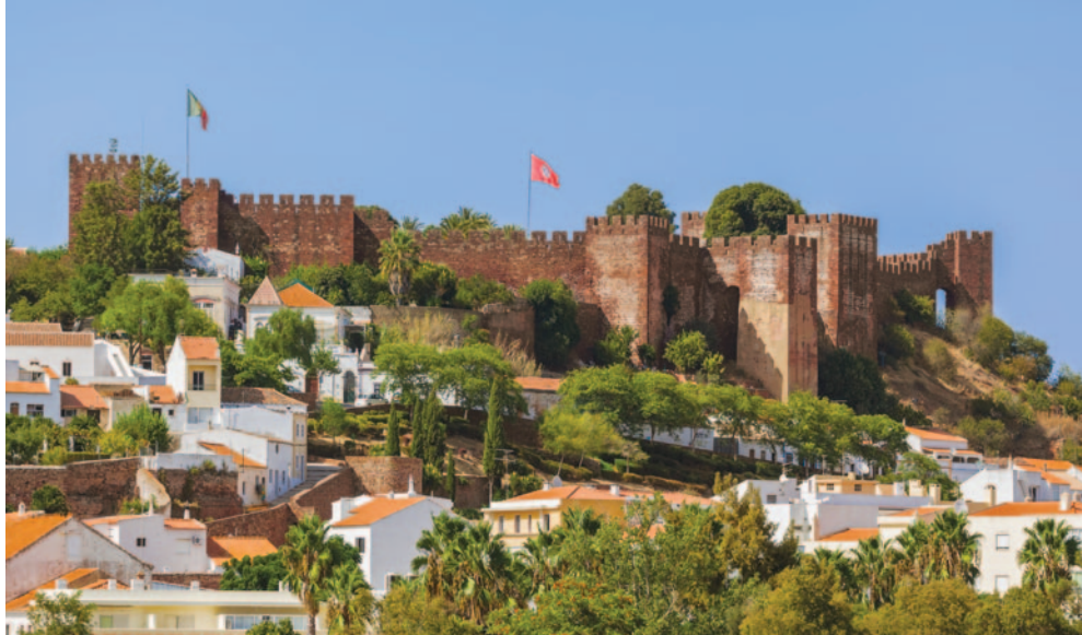
Portugal's attractive town of Silves is dominated by its castle