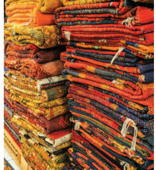
Rug Market, Tangier

industry, and culture. We will explore several of Oran's highlights, including the 17th-century Fort Santa Cruz that overlooks the city and the Sidi El Houari district. We will also visit the Medina Jedida, a massive market selling flowers, textiles, jewelry, and souvenirs of every description. Here we will have the opportunity to sample Algerian street food, including kerentica, a cake made with chickpea flower and eggs that is a specialty of Oran. (B,L,D)