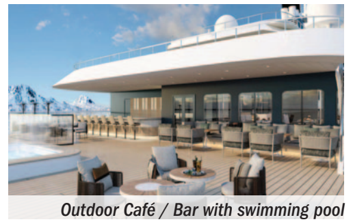
Outdoor Café / Bar with swimming pool

Built in Finland and launched in July 2022, Swan Hellenic's Vega is a new-generation expedition cruise ship. Although at 10,250 tons the ship is large enough to accommodate more than 250 passengers, Vega will accommodate a maximum of 152 guests in 76 spacious staterooms and balcony suites. The low guest density results in one of the most generous indoor and outdoor space-to-guest ratios among cruise ships.