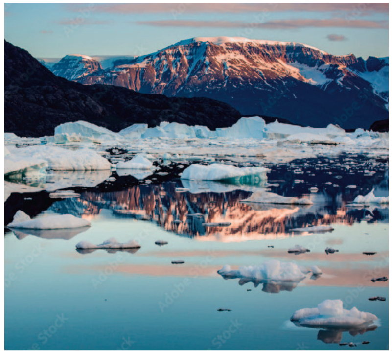
Scoresby Sound fjords