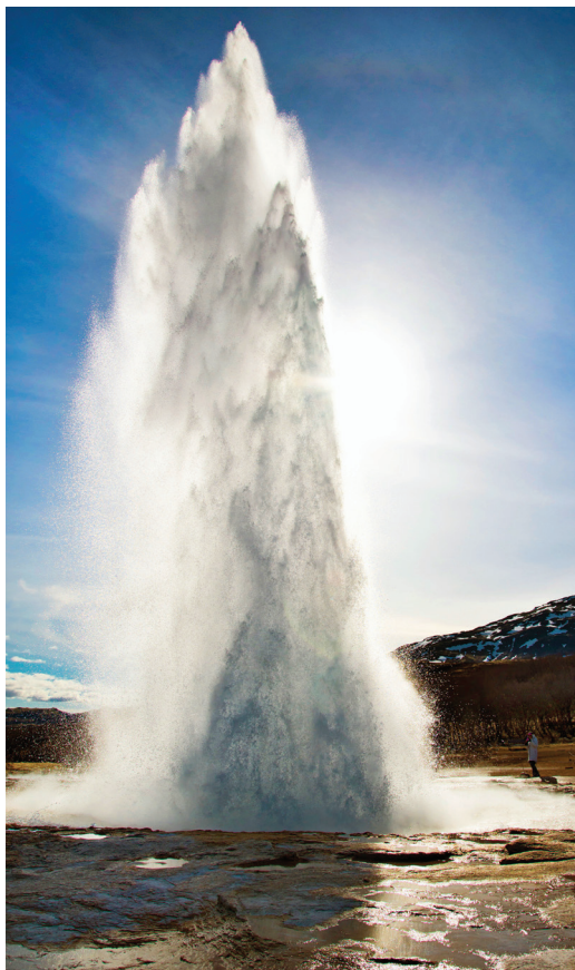
Iceland's hot spring geysers are famous natural attractions.

Day 11: Depart for U.S. Today we depart for the airport and our return flights to the U.S. B