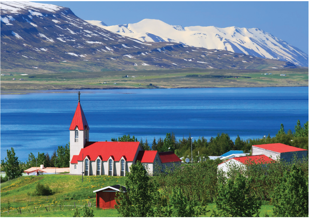
Iceland's landscape reveals an austere beauty.

the labyrinth of “echoing rocks” created by the spiral basalt formations of the arches and canyons here. Our last stop: jaw-dropping Dettifoss, Europe’s most powerful waterfall and Iceland’s “Niagara.” B,L,D