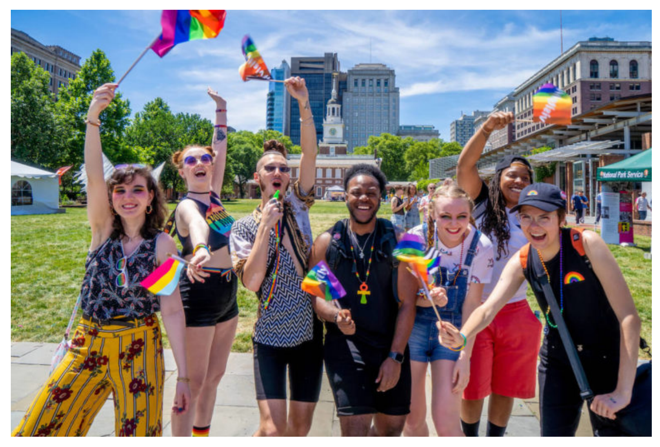
There are tons of ways to celebrate LGBTQ Pride in Philly this June

UKRAINE BENEFIT: Released a few months before the invasion of Ukraine, Stop-Zemlia (here's a trailer) is a coming-of-age story about an introverted teen in Kyiv. This weekend, Bryn Mawr Film Institute, in partnership with Philly Stands With Ukraine , is hosting a benefit showing for Voices of Children, a nonprofit providing mental health services for Ukrainian children impacted by the war.