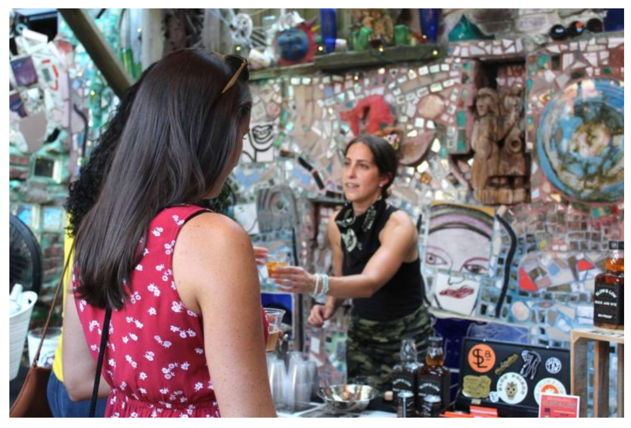
Twilight in the Gardens gives you the chance to explore — and drink at! — Philadelphia's Magic Gardens after sundown.

PHILADELPHIA MARKETPLACE: Happening every Friday and Saturday through October 1 , this hyperlocal bazaar gives you the chance to browse and shop a rotating variety of goods from local artists, crafters and retailers in the shadow of City Hall. 1 S. 15th Street