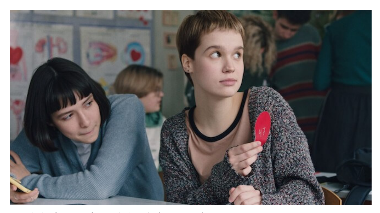
{\it Catch \ a \ benefit \ screening \ of \ Stop-Zemlia \ this \ weekend \ at \ Bryn \ Mawr \ Film \ Institute}

RAIL PARK BLOCK PARTY: This Saturday, the Spring Arts District's Noble Street closes down for a block party hosted by The Rail Park . Seven-piece brass band SNACKTIME will provide the soundtrack for the day's activities, which include art installations, a seed swap, guided meditations and arts and craft opportunities. Trestle Inn will be manning the bar at The Viaduct for all your day-drinking needs. Saturday, June 11, 2 to 8pm. North Broad and Noble streets, pay as you go.