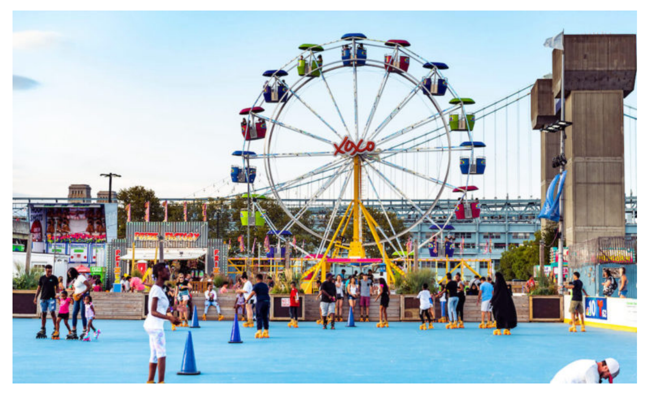
Blue Cross RiverRink Summerfest is now open along the Delaware River with summertime fun galore.

DELAWARE WATERFRONT ATTRACTIONS: Spruce Street Harbor Park and its neighboring Blue Cross RiverRink Summerfest are open for the season with ferris wheels, floating beer barges, carnival games, roller skating, hammocks in neon-lit trees, cute little lodges you can rent with friends. It's just too much excitement for one person to handle. Good thing it'll be around for our enjoyment all summer long. S. Columbus Boulevard