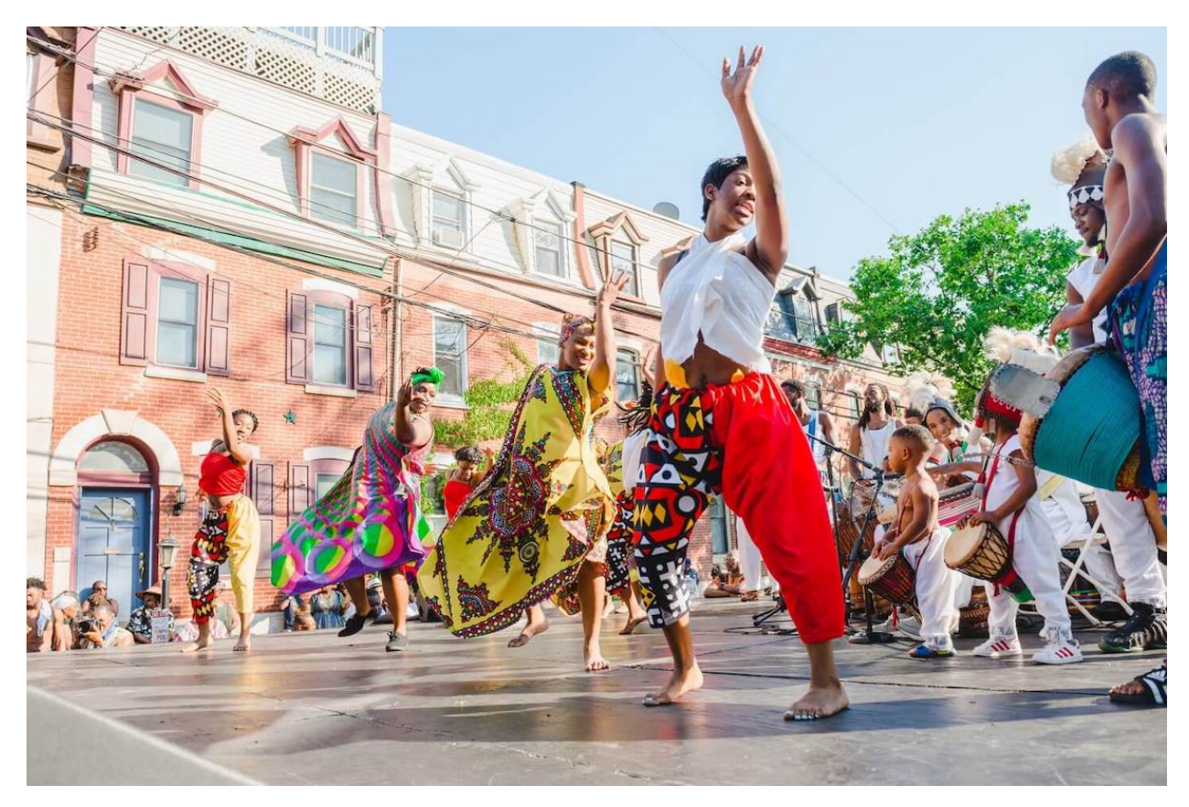
The awesome Odunde Festival brings all things African culture to West South Street June 12.

ODUNDE FESTIVAL: On Sunday afternoon, West South Street transforms into the country's largest African American street festival — a thrumming African market , and two-stage, all-day, all-out celebration of Black culture. The food itself is worth a visit. Sunday, June 12, noon. 23rd and South Street, pay as you go.