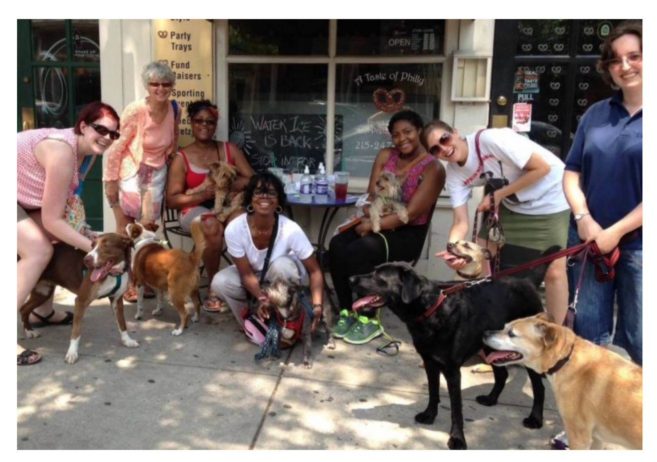
Petapalooza, a street festival for pets and those who love them, happens June 12 in Chestnut Hill

PETAPALOOZA: Chestnut Hill goes to the dogs, when Petapalooza 2022 brings out doggie pools, face painting, training exhibitions, vets and pet service providers, and more than a dozen pet rescue and adoption agencies with potential furry friends looking for forever homes. Both you and your animal companions can enjoy food and drink specials at participating pet-friendly establishments. The event is free and family-friendly. Sunday, June 12, 11am to 2pm. 8100 to 8700 Germantown Avenue, pay as you go.