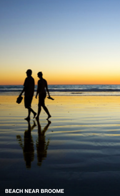
BEACH NEAR BROOME