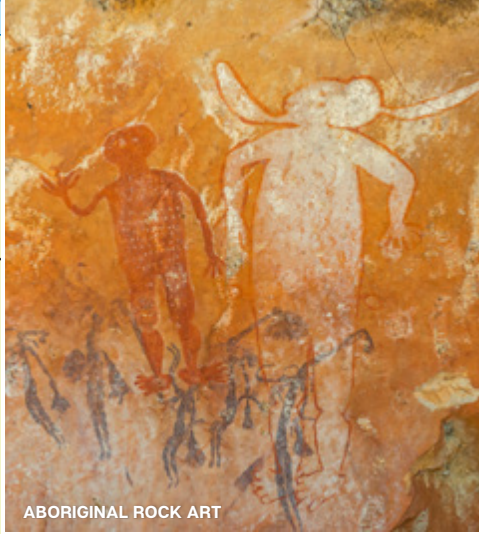
ABORIGINAL ROCK ART