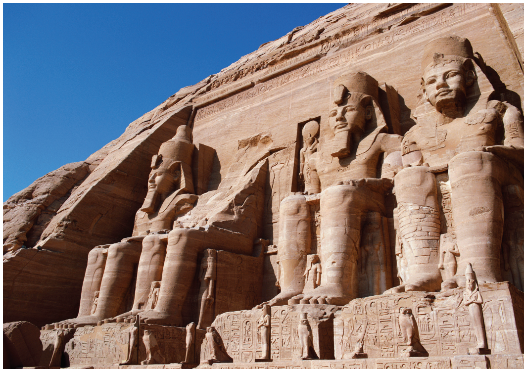
The magnificent temples at Abu Simbel commemorate Ramses II and his queen, Nefertari.

to our ship, we sail on to Amada, where we encounter the oldest of Nubia's Egyptian temples, the 18 th -dynasty Temple of Amada. B,L,D