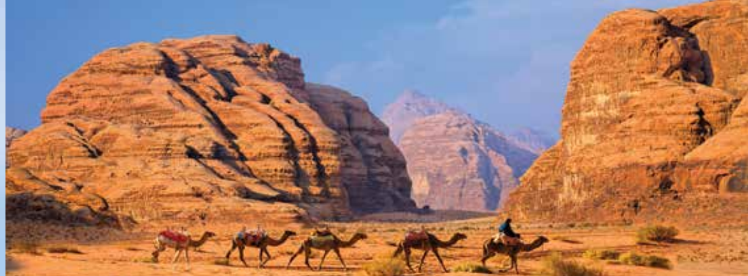
Look for Bedouins traversing Wadi Rum, a dramatic labyrinth of towering granite and sandstone formations.

of the glory of Egypt that have towered over the Western Desert for nearly 5,000 years.