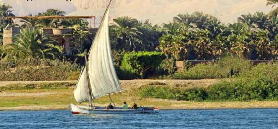
Photo this page: The mythology surrounding the Nile River has shaped the region's identity for thousands of years.

Cover photo: Stand before the Great Sphinx carved from a single piece of limestone.