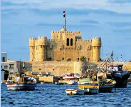
Beautifully preserved Qaitbey Fort was built to defend Alexandria from the Ottoman Empire.