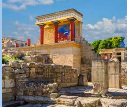
Admire the beauty of the Minoan Palace at Knossos where, in Greek mythology, the Minotaur was defeated by Theseus.

Lawrence of Arabia, as “vast, echoing and godlike.” Known as the Valley of the Moon, this region has seen human activity for nearly 12,000 years. This ethereal landscape of grooved canyons, soaring mountains, undulating sand dunes and rocky caverns is best experienced from a four-passenger open-air vehicle.