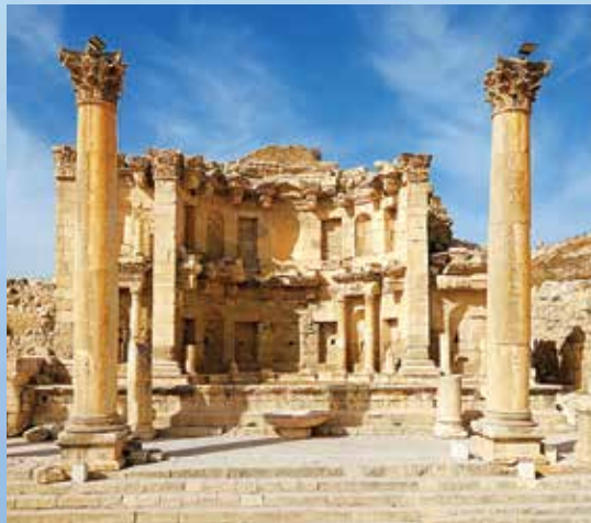
Visit Roman Jerash, including the Nymphaeum, the city’s main ornamental fountain.

Marvel at prodigious Hadrian’s Arch at the city’s entrance and dating to 129 A.D., the intricately carved Temples of Artemis and Zeus and the immense scale and sublime architecture of the historic Forum.