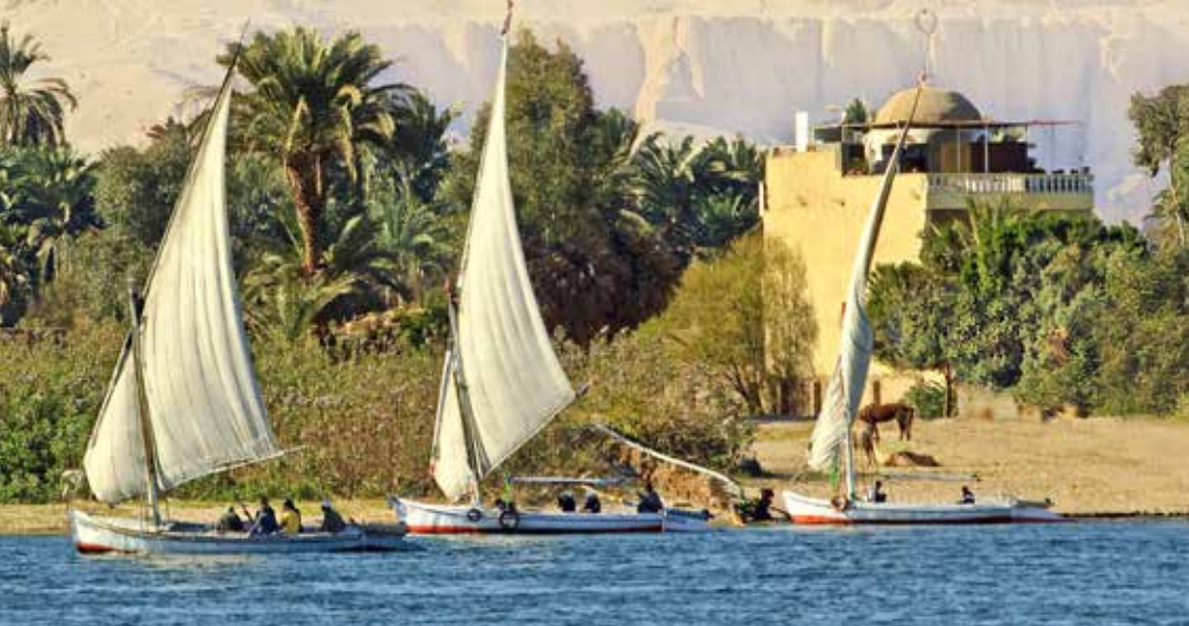
PHOTO CREDITS: Alamy, Age Fotostock, Bridgeman Art Library, ©Ponant, Shutterstock, Water Rights Images, ©Barbara Ann Weibel; all images are rights managed and cannot be used without permission.

The safety and well-being of our travelers remains our highest priority. All passengers traveling on our programs are required to present confirmation of a full COVID-19 vaccination, and, as well may have to produce evidence of a recent negative COVID test. All our staff are committed to adhering to all health and safety protocols from the start of your trip to the end as directed by the United States Center for Disease Control and Prevention, overseas health officials, as well as those protocols mandated by your cruise company (if applicable). All passengers over 65 are required to have a third vaccine (booster) if their second vaccination was administered 6 months ago. Detailed protocol information tailored to your travel program will be mailed to you along with additional pre-departure information.