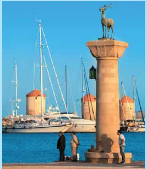
PHOTO CREDITS: Alamy, Bridgeman Art Library, Dreamstime, Ponant®, Shutterstock; all images are rights managed and cannot be used without permission.

The bronze stag symbolizes the Colossus of Rhodes, one of the Seven Wonders of the Ancient World.