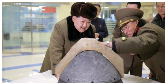
Kim Jong-un, supreme leader of North Korea, inspects a warhead.

Today, North Korea is one of the most impoverished, isolated societies on earth. Some estimate that as many as two million North Koreans starved to death between 1995 and 1998 after a series of floods. Estimates are that out of a population of twenty-two million, thirteen million North Koreans are suffering from malnutrition. Sixty percent of all North Korean children are malnourished—the highest level in the world. Nevertheless, North Korea has one million soldiers in its military, many of whom are poised along the border with South Korea. North Korea is one of the most highly militarized countries in the world. In 2001, North Korea spent more than 30 percent of its gross domestic product (GDP) on the military. Nearly eight thousand North Korean artillery pieces are along the border, many within range of Seoul.