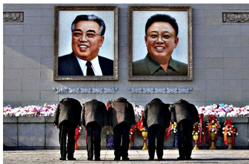
A group of North Koreans pay tribute to the former leaders of the country.

In 1910, Japan annexed and occupied the Korean peninsula following the Russo-Japanese War. At the end of World War II, the Japanese forces in Korea surrendered to the United States in the South and to the Soviet Union in the North. A line of separation between the two regions was created by the superpowers. This line divided the country in two—a communist North and a capitalist South.