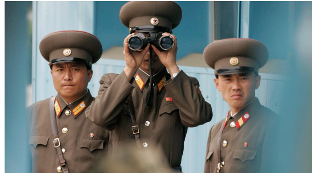
North Korean soldiers on patrol at the DMZ.

From the Pakistan/India nuclear arms race, to the hotly debated nuclear program of Iran, to Syria's apparent use of chemical weapons on civilians, the spread of nuclear, biological, and chemical weapons poses a grave threat to global security. With the development and circulation of these weapons of mass destruction (WMDs) and related materials, technologies, and expertise, North Korea's WMD programs, in particular, have remained a key challenge towards maintaining peace and security for the international community.