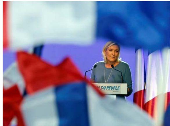
French National Front (FN) political party leader Marine Le Pen delivers a speech during a FN political rally in Frejus, France.

In many Western democracies, 2016 can be seen as a tumultuous period for traditionally mainstream political parties. Many established parties struggled to respond to rapid changes in the political landscape as voters’ dissatisfaction was expressed through lower turnouts or rising support for previously smaller movements. 1 The unexpected, by many, triumphs for the Brexit campaign in the United Kingdom and President Donald Trump’s campaign in the United States are perhaps the most high profile indicators of a shifting political environment. 2 But, these two recent examples are far from unique.