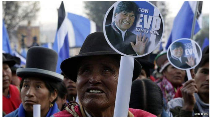
Supporters of Bolivian President Morales gather for an election campaign meeting in La Paz.

Immigration has proven to be an extremely successful policy issue for anti-establishment populists, providing a common thread for their electoral advances across different countries. 24 However, the links between immigration and populist voting are not straightforward: in the United Kingdom's vote on EU membership, for instance, areas with more immigrants were more likely to support remaining in the European Union. 25 One possible explanation is that what matters to the voters is not so much absolute levels of immigration but rates of change. 26