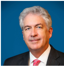
BILL BURNS, President, Carnegie Endowment for International Peace