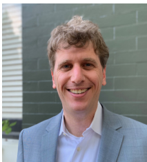
MATT STOLER, Author of The 100 Year War Between Monopoly Power and Democracy