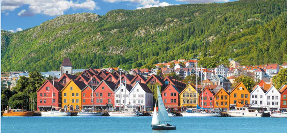
Chromatic wooden buildings in Bergen's Bryggen (the old wharf), a UNESCO World Heritage site, hark back to the city's historical role as one of northern Europe's oldest trading ports.

including late-Neolithic stone houses, a Bronze Age village, an Iron Age broch and wheelhouse, Norse longhouses, a medieval farmstead and a 16 th -century laird's house.