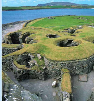
Ruins at Jarlshof evoke thousands of years of history from the Neolithic to the Middle Ages.

the Year in 2011 and were featured in a cover article of National Geographic in 2014.