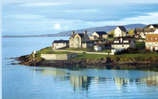
Founded as a marketplace for 17 th -century Dutch herring fleets, Lerwick merges coastal charm with a rolling, heathered landscape.

Winding through the austere Scottish Highlands, the 21-arch Glenfinnan Viaduct frames Loch Shiel, where steep slopes reflect into the loch's sparkling freshwater.