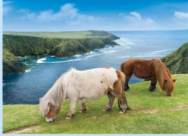
Indigenous Shetland ponies are a strong breed with heavy coats and a maximum height of only 44 inches.

Attend the Captain's Welcome Reception this evening.