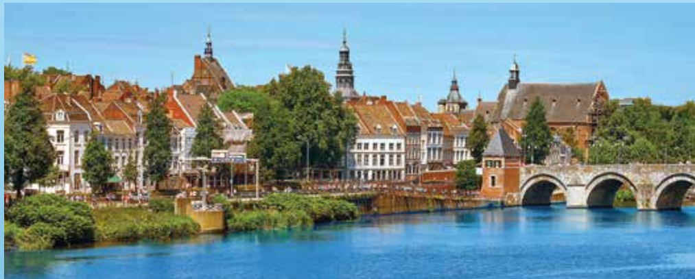
Photo below: Look out onto the storied River Meuse from the picturesque town of Maastricht.

Cover photo: Cruise through the Netherlands, where tulip blooms announce the arrival of spring.