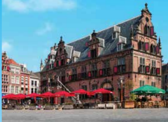
Discover the Netherlands' oldest city, Nijmegen, with its historic De Waagh, still a central gathering place.

CULTURAL ENRICHMENT: On an expert-guided tour of the museum, see works by quintessential artists such as Picasso, Monet, Renoir and Manet, as well as captivating late 19 th - to 21 st -century pieces by Rodin, Moore and Dubuffet, wreathed in the idyllic woodland scenery of the 60-acre sculpture garden.