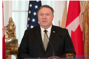
Pompeo: Nord Stream 2 threatens U.S. energy security