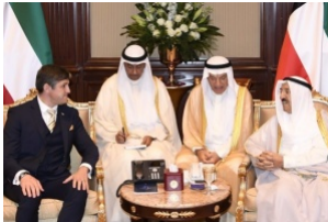
New Ukrainian ambassador begins diplomatic mission in Kuwait